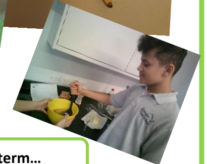
A small selection of pictures from this half term...