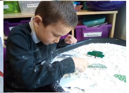
A small selection of pictures from this half term...